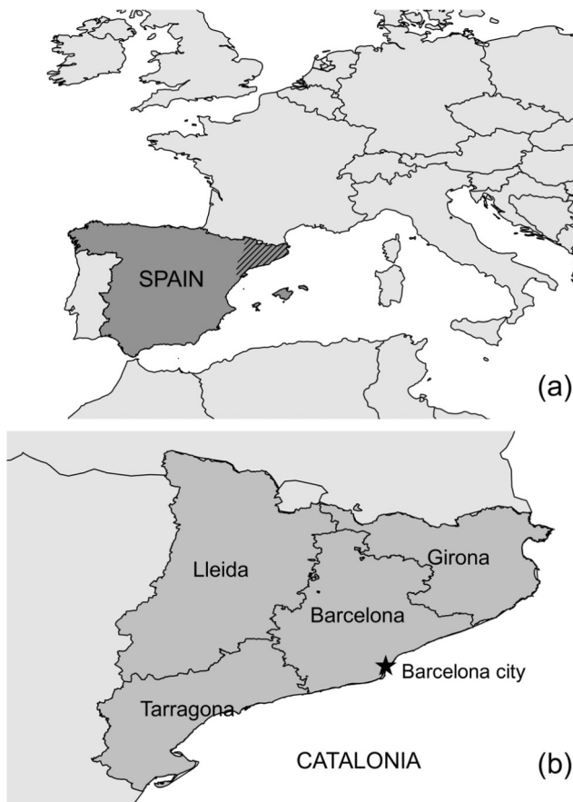
Fig. 1. Map of the study region. (a) The region ( comunitat autònoma ) of Catalonia in Spain. (b) Catalonia with its 4 provinces and its administrative city.