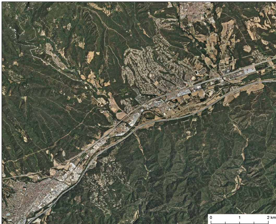
Fig. 3. Example of the high wildfire risk landscapes currently existing in Catalonia. The orthophoto shows the Montseny area belonging to the Barcelona Metropolitan Region. Strategic transport infrastructures, concentration of industrial activities and dispersed settlement structures among extensively forested ranges make the region highly vulnerable to large wildfires.

experiential knowledge (Bernard, 2002). The first author spent two wildfire seasons in Catalonia (23 June to 24 August 2014 and 15 June to 27 July 2015) with different GRAF teams following their day-to-day